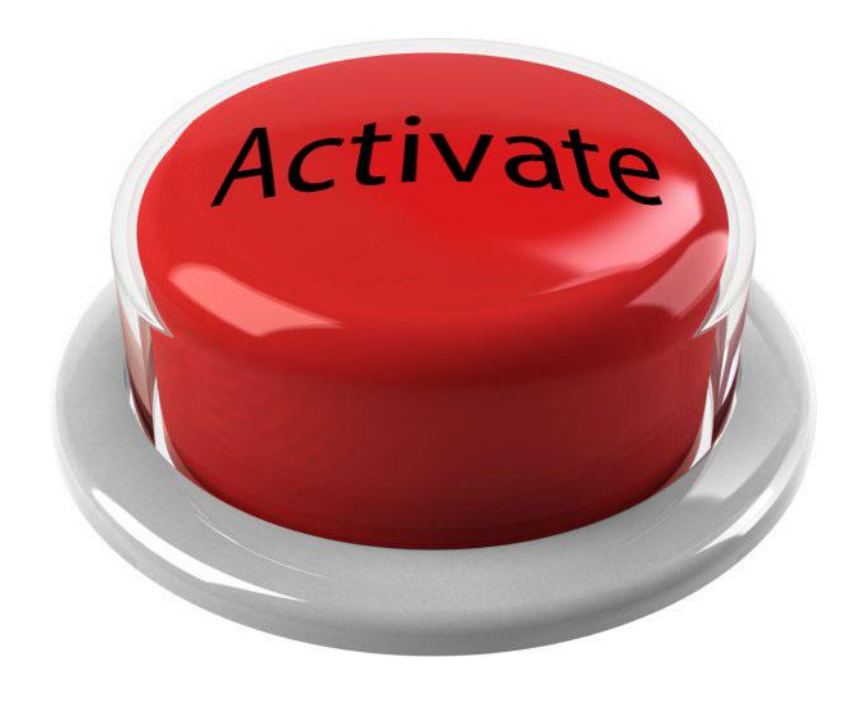
It is time to learn how to activate God's Favor in your life!